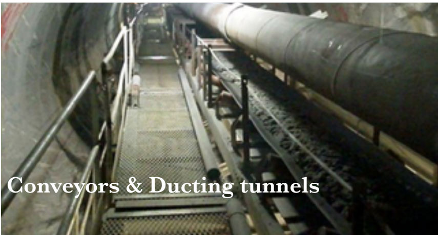
Conveyors & Ducting tunnels