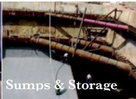
Sumps & Storage